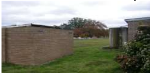
The Amenities Block

At a recent meeting of the Trustees it was decided to update the toilets at the cemetery. Not hard to update: the present system is a can.