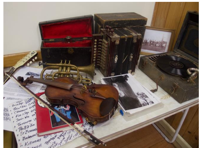
Old time instruments