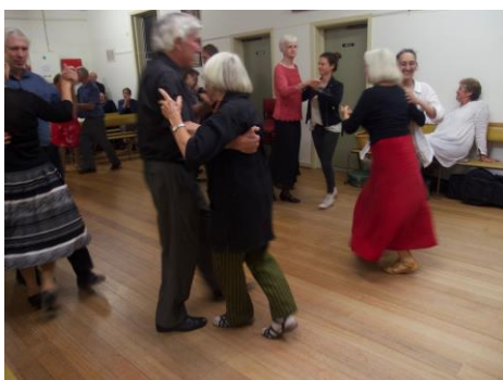
A whirl around the dance floor, Photo courtesy Petrus Spronk