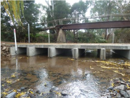
Completed works