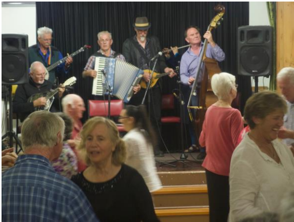
The band and the dance floor

If you want to brush up your old time dancing skills there's another dance coming up on Friday June 29 th at Yandoit hall.