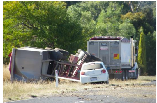
The roll-over on Hepburn-Newstead road