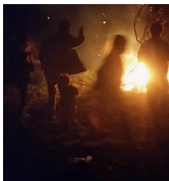
Feeding the flames.....