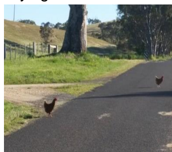
Playing chicken on the road

On another issue altogether, I've found two perfect pictorial examples of two well-known Ausi sayings: