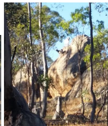
and acting the goat