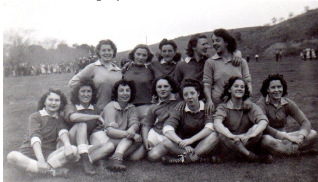
Yandoit Ladies Football Team 1952