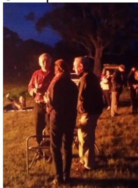
By the light of.....