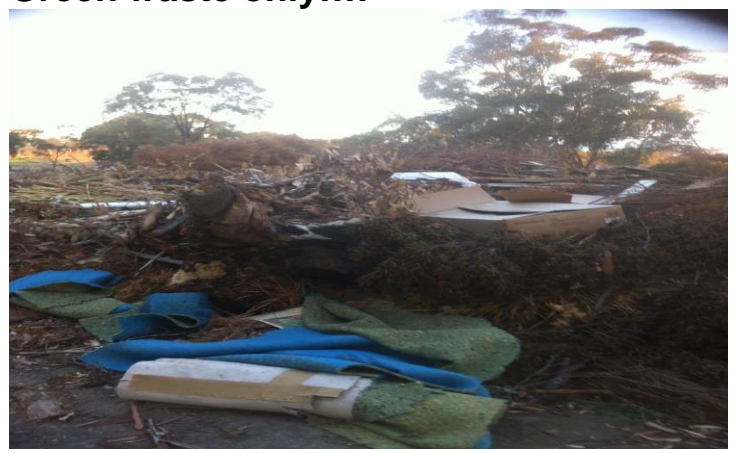
The bonfire heap has been moved but there's still

Yandoit Recreational Reserve News. Green waste only!!!!