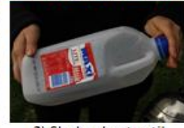
2) Shake about until all bottle is hot.