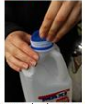
3) Pour out the hot water and push in the cap.