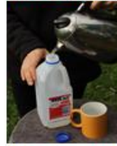
1) Pour a little boiling water into bottle.