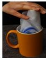
6) Now look at how much of your bin space you have saved, and how much you have saved Hepburn shire, by them not having to cart away all that extra air. Also now rinsed, it will not smell