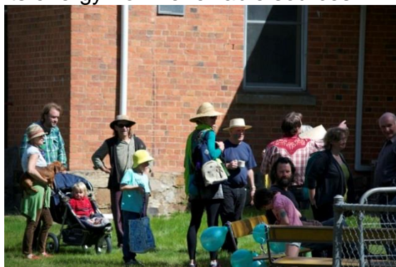
Mix of people and ages at the energy day.

Did you know that Germany is producing 80% of its energy from renewable sources?